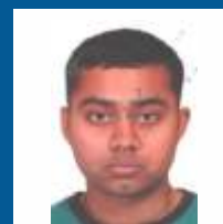
AIR-108 PARNAV BIST