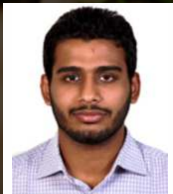
ANKUSH AIR 3