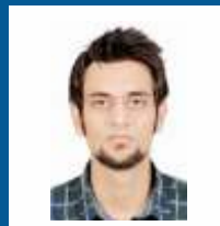
AIR-52 RAGHAV SIGNAL